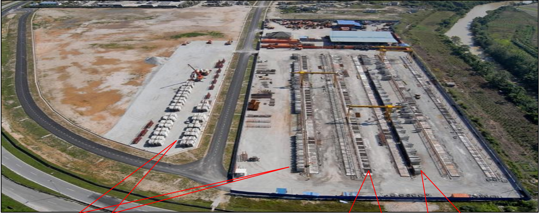
External transport to project